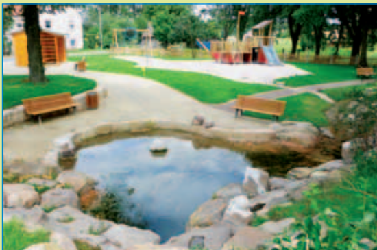
Spring of the Vils

The spring capture of the Vils is located in the hamlet of Kleinschönbrunn, which was originally part of the former community of Großschönbrunn. After a one year construction period, the redesign of the Vils spring at Kleinschönbrunn completed the village renewal in August 2009. Re-modeled streets, squares, re-naturalized banks and the reshaped spring of the river Vils with water playground in a creative design considerably improved the village life and are now an attraction for the young and old. The transformation of the village center of Kleinschönbrunn was the second winner of the 2010 Bavarian State Award for Country and Village Development.