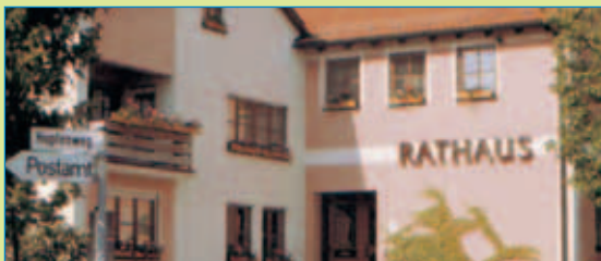
Town hall

92271 FREIHUNG/Oberpfalz, Rathausstraße 4 Phone: 09646 9200-0, Fax: 09646 9200-30 E-Mail: poststelle@Markt-Freihung.de Webpage: www.Freihung.de